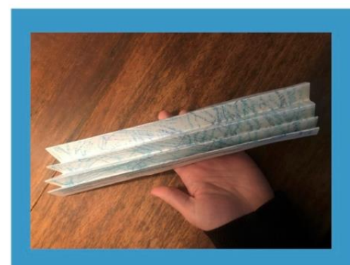
Step Three: Take another piece of paper and fold like an accordion. These will be your wings!