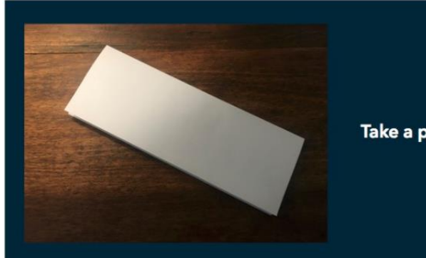
Step One: Take a piece of white paper and fold it in half (hot dog style).