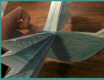
Step Four: Cut a quarter-sized slit towards the front of your bird's back and slip in your folded wings.