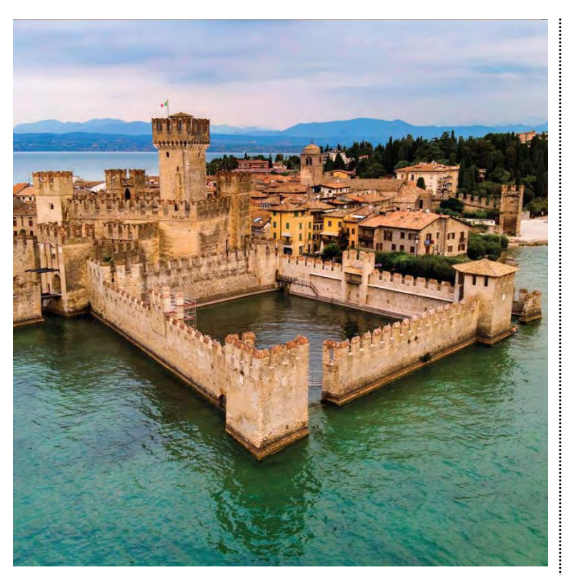
9 Days ● 10 Meals : 7 Breakfasts, 3 Dinners

HIGHLIGHTS... Padua, Glassblowing Demonstration, Venice, St. Mark's Square, Lake Garda, Sirmione, Lake Maggiore, Lake Lugano, Lake Como, Bellagio