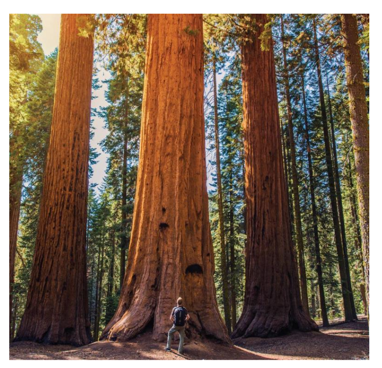
8 Days ● 10 Meals: 6 Breakfasts, 1 Lunch, 3 Dinners

HIGHLIGHTS... Seattle, Mount St. Helens Visitor Center, Portland, Choice on Tour, Columbia River Gorge, Hood River, Yaquina Head Lighthouse, Newport, Bandon State Natural Area, Rogue River Cruise, Redwood National Park, Avenue of the Giants, San Francisco