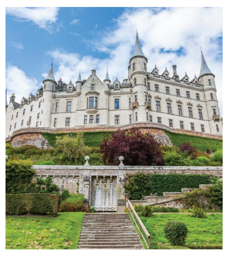
10 Days ● 14 Meals : 8 Breakfasts, 6 Dinners

HIGHLIGHTS... Scottish Cooking Experience, Royal Edinburgh Military Tattoo, Choice on Tour, Edinburgh Castle, St. Andrews, Sheepdog Demonstration, Dunrobin Castle, Orkney Islands, Loch Ness, Isle of Skye, Armadale Castle, Whisky Distillery, Bagpipe Lesson