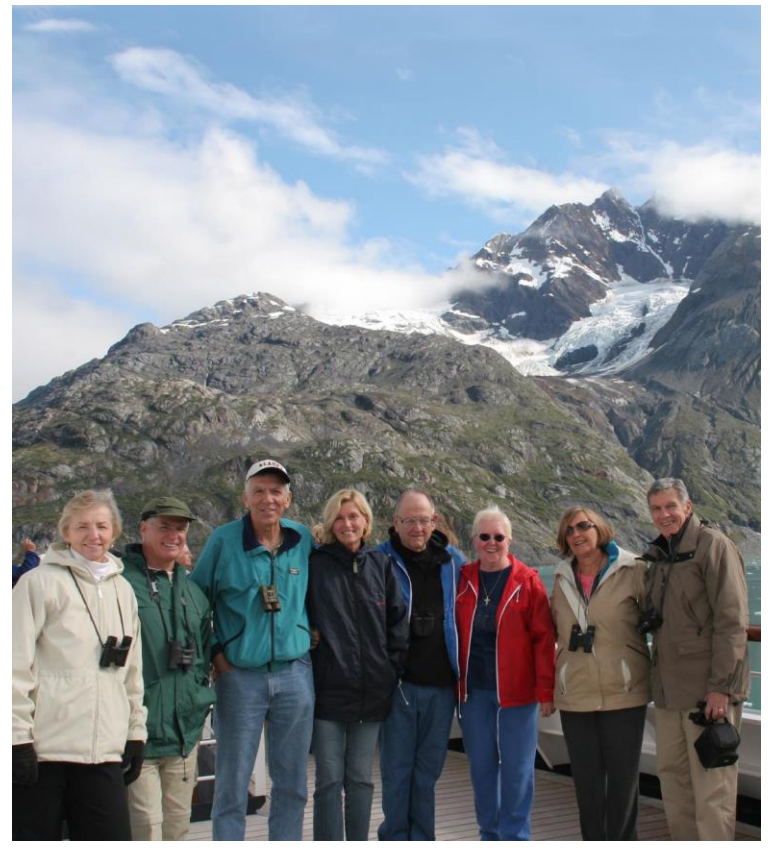
12 Days • 26 Meals: 11 Breakfasts, 7 Lunches, 8 Dinners

HIGHLIGHTS... Fairbanks, Sternwheeler Discovery, Music of Denali Dinner Theater, Denali National Park, Tundra Wilderness Tour, Luxury Domed Rail, Anchorage, Hubbard Glacier, Glacier Bay, Skagway, Juneau, Ketchikan, Inside Passage