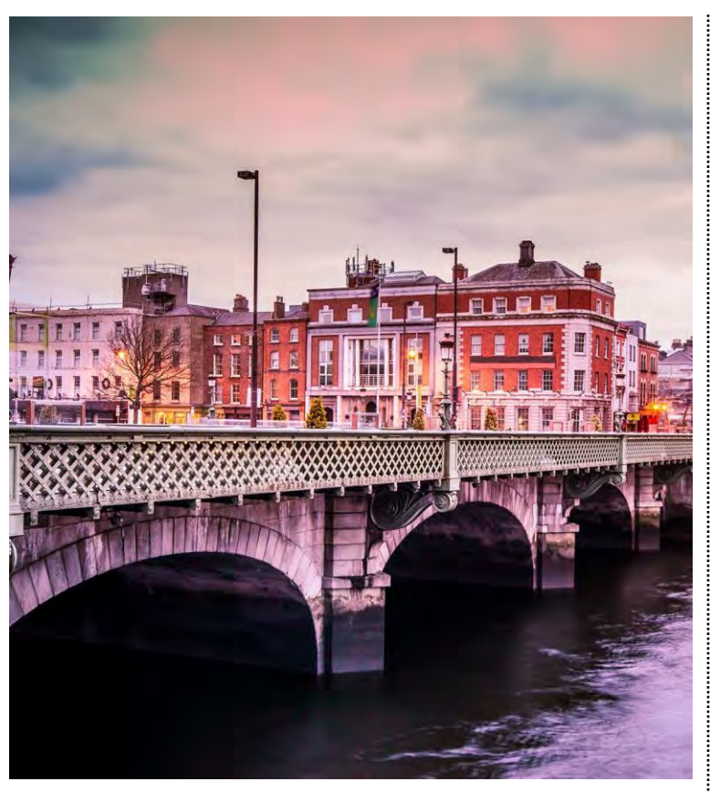
12 Days • 15 Meals: 10 Breakfasts, 5 Dinners

HIGHLIGHTS... Dublin, Irish Evening, Choice on Tour: Dublin City Bus or Walking Tour, Kilkenny, Waterford, Choice on Tour: Waterford Crystal Factory or Waterford Medieval Museum and Wine Vault, Blarney Castle, Killarney, Jaunting Car Ride, Ring of Kerry, Limerick, Cliffs of Moher, Sheepdog Demonstration, Galway, Castle Stay