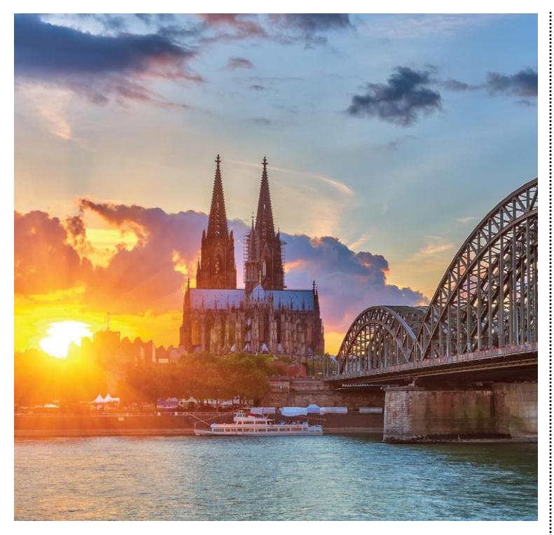
9 Days • 20 Meals: 7 Breakfasts, 6 Lunches, 7 Dinners

HIGHLIGHTS... Amsterdam, 7-Night River Cruise, Rhine River, Cologne, Moselle River, Cochem, Wine Tasting, Koblenz, Rüdesheim, Siegfried's Mechanical Music Museum, Mannheim, Speyer, Strasbourg